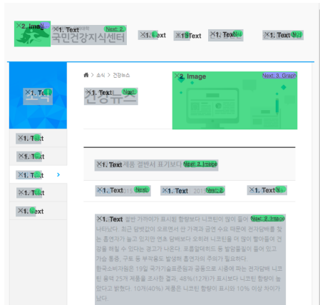
Figure 2: Interface we used to generate the dataset for CNN training